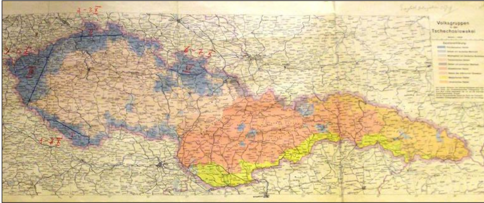
Fig. 2. Munich Agreement map (the original).

27 January, p. 2) suggested that perhaps England was already ready to recognize the government of F. Franco because it required silver, copper and ore for its own needs. But Spanish nationalists, who had taken up the key positions, granted deposit concessions to Germany and Italy. In confirmation of that information the Ukrainian press reported that on October 1, 1938 B. Mussolini called for the withdrawal of volunteers from Spain, and on October 9 the League of Nations established a commission to monitor their withdrawal from the warring country. France, in its turn, fearing isolation, agreed to close the Pyrenees for transportation of munitions from the Soviet Union and concluded a trade agreement with Germany (God krizisa, 1990, p. 185).