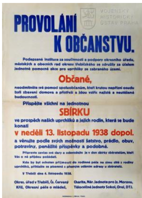
Ordinance on the collection of refugees, Prague. 1938.

Subcarpathian periodicals contain information about persistent provocations on the German-Czechoslovak border. SNP activists, interested in chaos and confusion, armed with hand grenades and Iver automatic revolvers of German production, and spurred on by K. Heinelein’s appeals for “reunification with the German mother state and fight by all means against “foreign riders” (Ukrainske Slovo, 15 September, p. 1), made power assaults upon gendarmerie and post offices in the border lands. We learn from the press that border guards and customs officers used signal flares rather than fire arms for bullets not to reach the territory of Germany and complicate the already tense relations with the neighbor. Supporting the protesters, Hitler said that “...the Germans were neither unarmed nor defenseless and the Czechs would not chase them as a wild beast” (Svoboda, 17 September, p. 1). That speech has an unambiguous context because there were both the killed and wounded in the clashes whereas Czech courts did not react to the events through the so-called “inactivity” (Svoboda, 17 September, p. 1). The whole world watched the Czechs, German communists and socialists to start leaving the Sudeten.