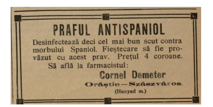
Commercial in newspaper Libertatea, around November/December 1918 – "The Anti-Spanish dust disinfects, therefore it is the best shield against the Spanish disease. Let each man be provided with this dust. Price 4 crowns"

Therefore, "with the Spanish disease everywhere" ( Libertatea , 1918, no. 4, p. 1), the organization of the National Assembly suffered as well. Soldiers from the National Guards, who had undertaken the security of the area, also suffered from the flu, especially since they were often insufficiently equipped for the cold weather and had to patrol permanently in the localities and outside them. However, the encouraging voice of the commanders had strong effects, and the thought that those days were decisive for the fate of the nation made them move on (Hulea, 1978, p. 448). As already mentioned, several delegates were absent from Alba Iulia, most likely falling ill in the time lapse since their nomination as representatives of the Romanian nation [most elections were held on November 25–27] and the scheduled date for the trip to Alba Iulia [mostly, on November 29–30].